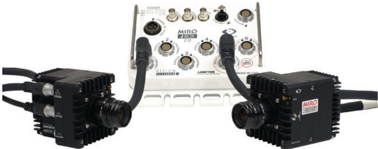
Miro C321/C321J Connectors With the Miro Junction Box 2.0