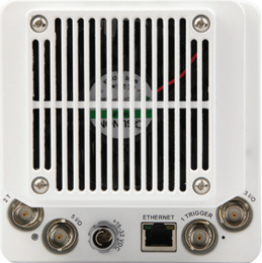
VEO S-model (Top), L-model (Bottom)