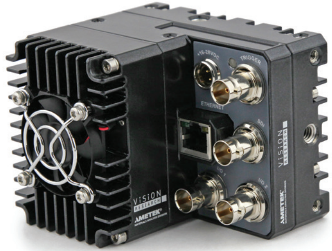
Miro C211 Connectors