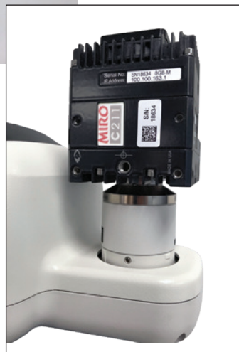
Miro C211 mounted to microscope