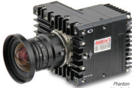
Phantom Miro C110